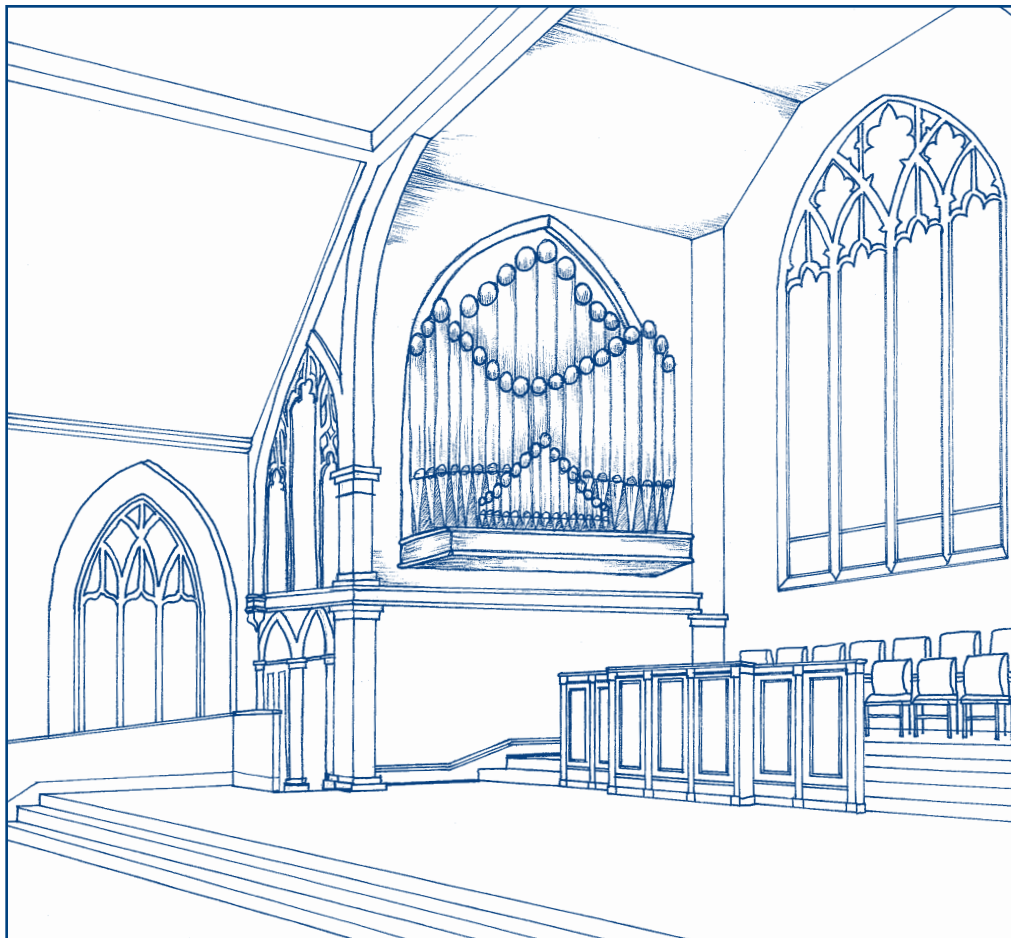
Conceptual drawing of chancel area by Arthur Funk and Sons.

The proposed pipe organ will help current and future congregations at First Church to glorify God in worship for many years.